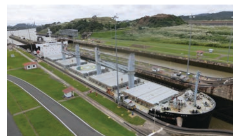
A tanker passes through the existing Miraflores Lock on its way to the Pacific Ocean.

was once-in-a-lifetime. For those of us who have seen and done many remarkable things, the Global Engineering Conference was right up there with some of my best of life experiences. I'm still thrilled that I made the decision to attend! ■