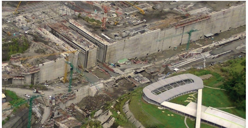
Aerial view of construction at the new Atlantic Lock. Note the two "slot" cuts perpendicular to the canal wall. These "slots" will hold the new rolling lock gates which will block the canal at this end. Another set will be located at the far right – outside the photo – to block the northern end of the lock.