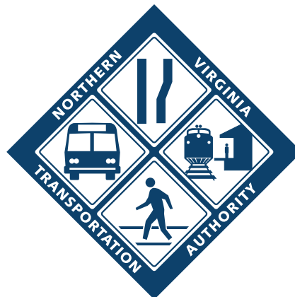
The Authority for Transportation in Northern Virginia