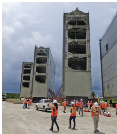
Rolling lock gates on display for installation in the new Atlantic Lock – cross section.

tremendously informative. 1 By the end of the conference, I realized that there were more interesting sessions than I had time to attend!