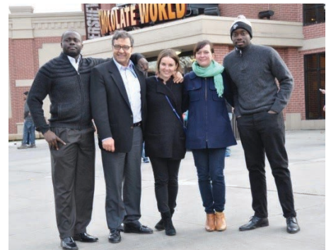
ASCE Region 2 Conference, November 8, 2014, Hershey Park, PA, Team University of District of Columbia and Faculty Advisor