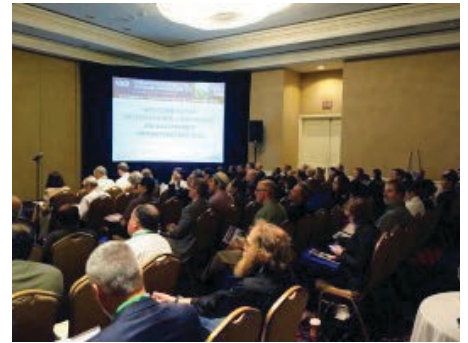
More than 300 people attended ASCE's first International Conference on Sustainable Infrastructure 2014.