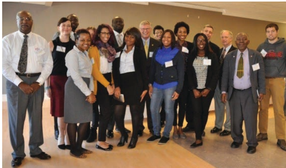
The University of the District of Columbia & Howard University: Two Strategic Partners and Sister Institutions in the Nation's Capital. ASCE-Student Members and Faculty Advisors, November 8, 2014